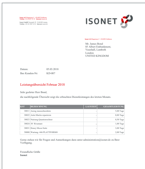
DESIGNABLE REPORTS target group-oriented data preparation