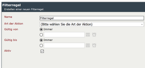
FILTER RULES management and configuration of rules and conditions